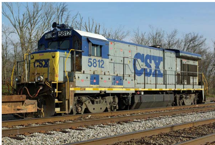
CSX B36-7 in the house track at Crofton, March 23, 2009

It's a bit of a shame to see such proud units relegated to mundane work train or yard service but it is a tribute to their heritage that they are still earning their keep after 23 years of service.