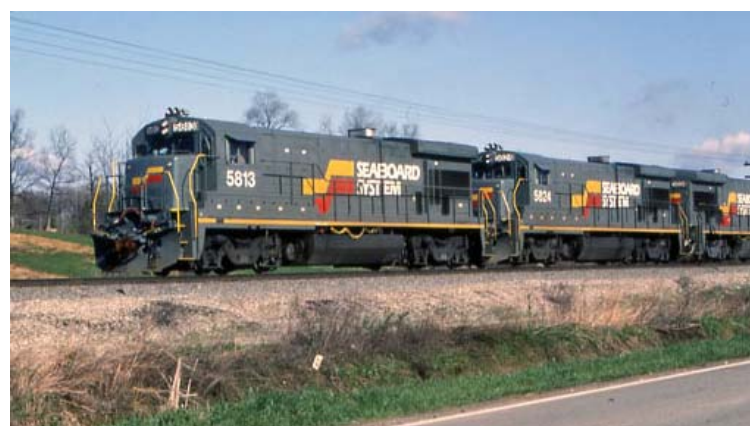
Northbound intermodal at Nortonville April 6, 1985